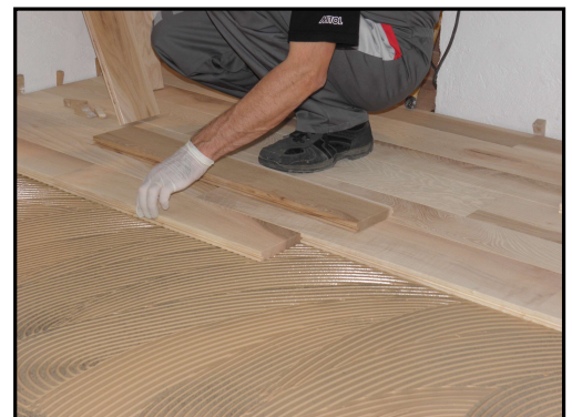
Universal use, Easy-to-clean