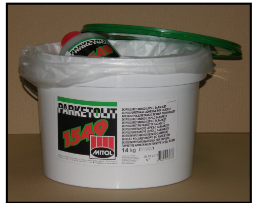
Adhesive with neutral odour, water and solvents free.

For more information, please call ++386 573 12 326 or mail to prodaja@mitol.si .